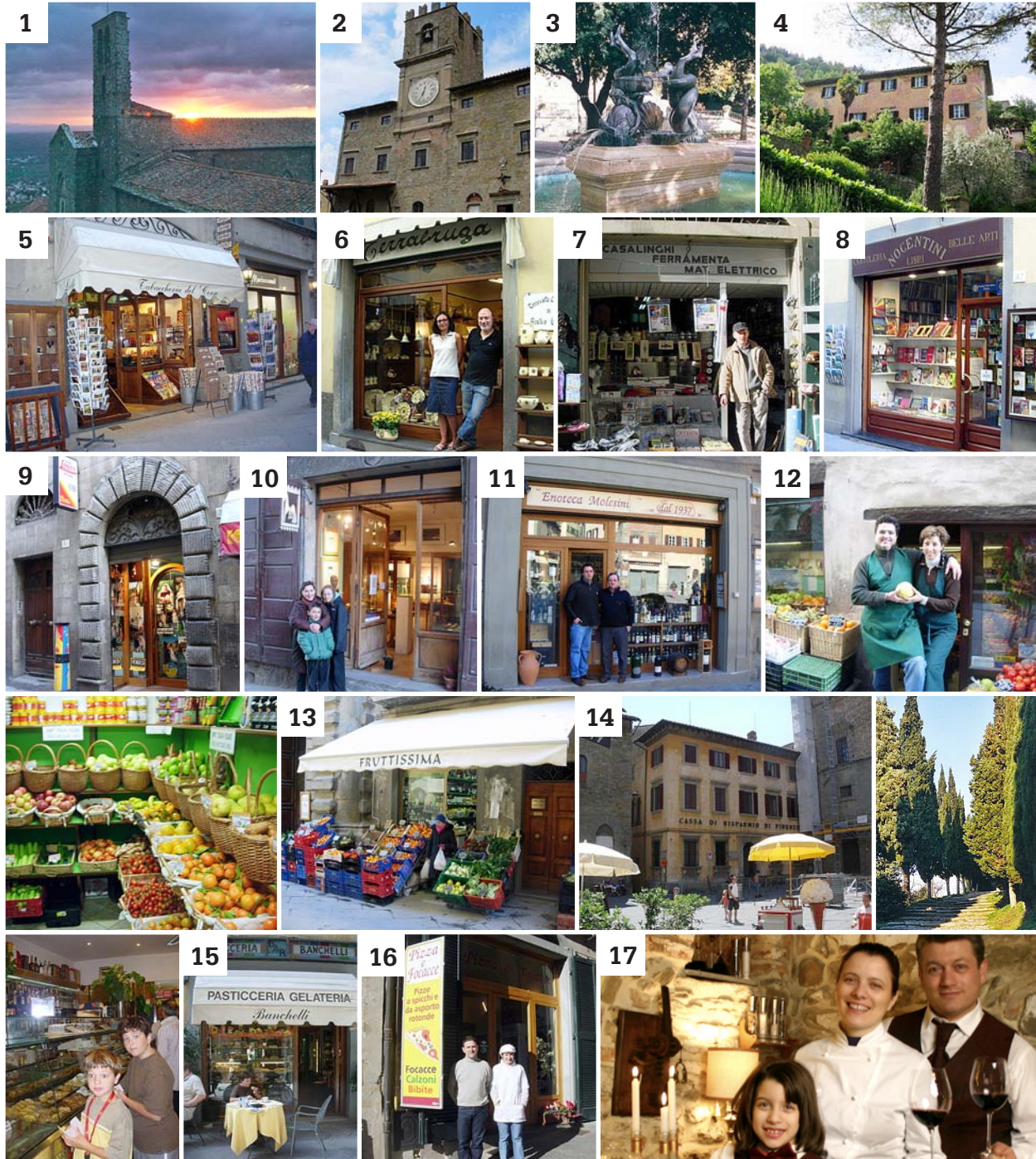
1. San Francesco Church 2. Comune, Piazza Repubblica (page 9) 3. the park (page 9) 4. "Under the Tuscan Sun" house (page 9) 5. tabaccheria del corso/il pozzo (page 10) 6. terrabruga ceramica (page 10) 7. ferramenta milloni (page 10) 8. neocentini libri (page 10) 9. foto lamentini (page 10) 10. falegnameria rossi (page 10) 11. molesini market and enoteca (page 12) 12. frutta e vedura (page 11) 13. fruttissima (page 11) 14. gelateria snoopy (page 13) 15. pasticceria banchelli (page 12) 16. pizza e focacce (page 13) 17. la buccaccia (page 12)